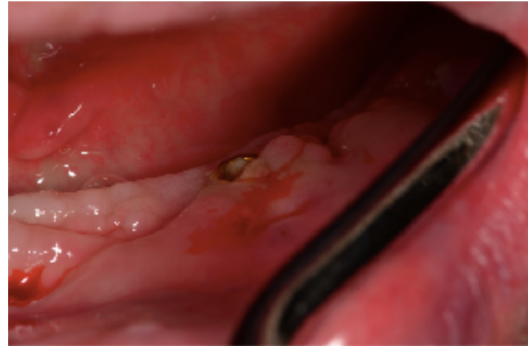
1 month post-operative